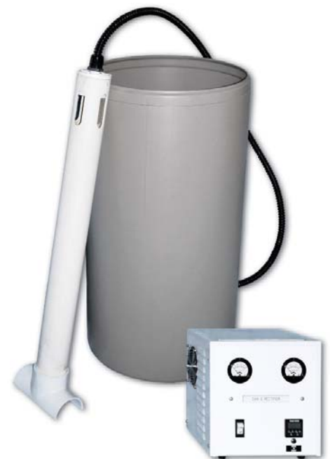
The SANILEC® 6 produces up to 6.6 pounds (3 kilograms) of chlorine equivalent per day.